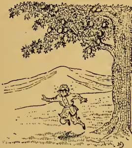
THE HOLLY TREE.

I was answered by a sharp knock on my own head, and on looking up was met by another in my face.